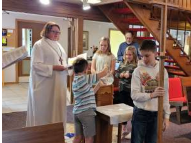
All Saints Day November 7, 2021